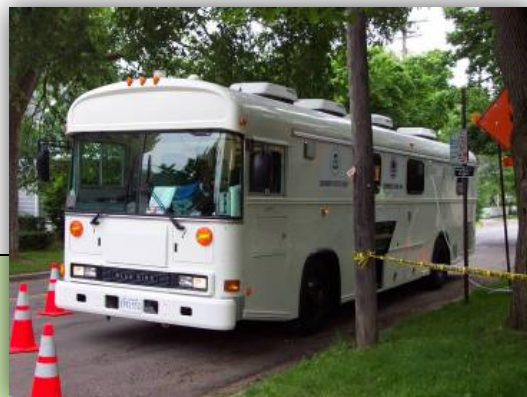
Figure 1: EPA's Trace Atmospheric Gas Analyzer (TAGA)

This will include a demonstration of the EPA mobile lab, a poster session, and an update presentation of the groundwater and air sampling activities in the neighborhood.